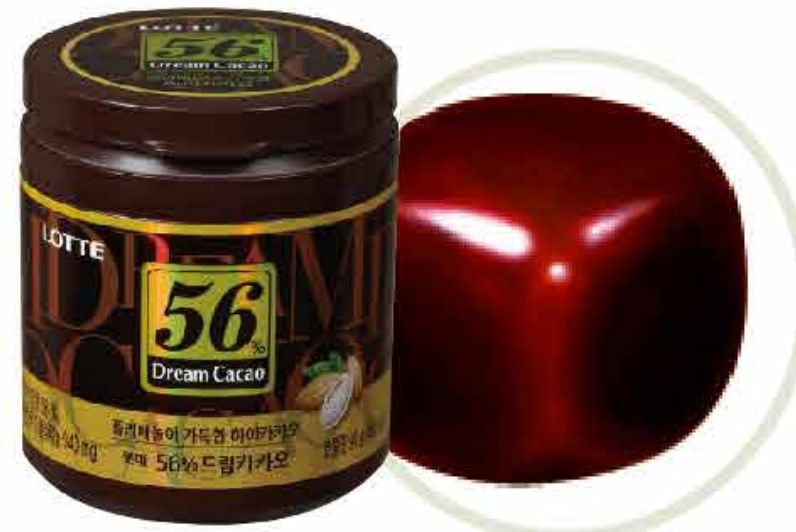
CACAO 56% 86G*6EA*4B/L