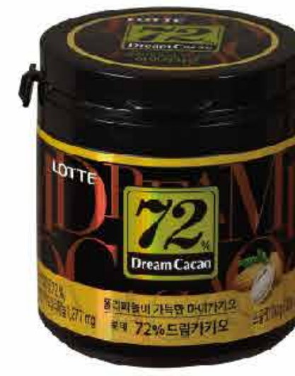
CACAO 72% 86G*6EA*4B/L