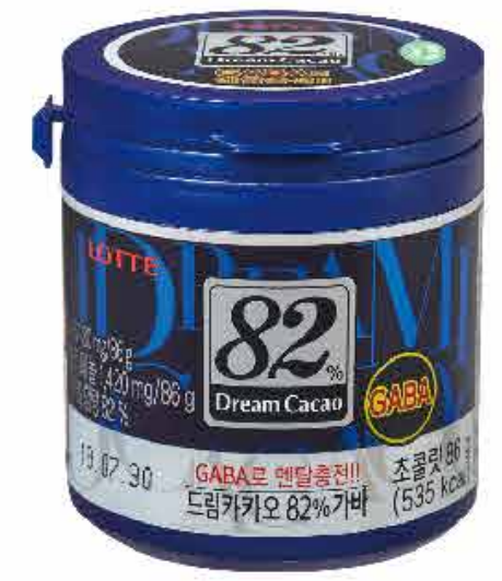
CACAO 82% 86G*6EA*4B/L

• Cubic-shaped chocolate with Polyphenols from premium cacao bean.