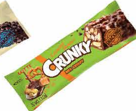
MIX CRISPY 32G*10EA*6B/L