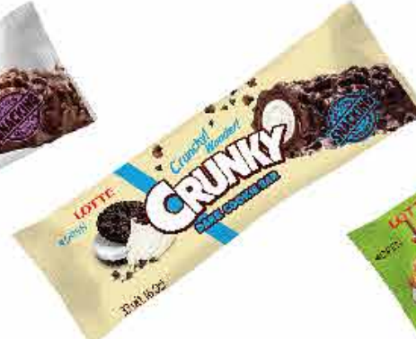
DARK COOKIE BAR 33G*10EA*6B/L