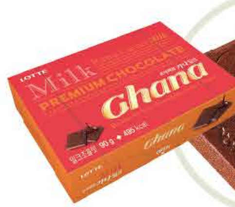
MILK 90G *8EA*3B/L