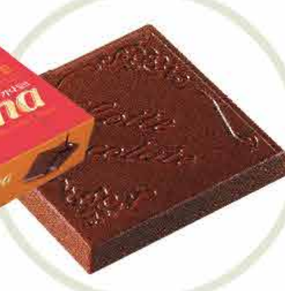
BLACK 90G *8EA*3B/L