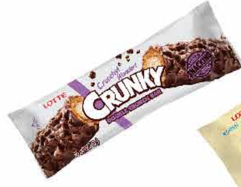
DOUBLE CRUNCH BAR 36G*10EA*6B/L